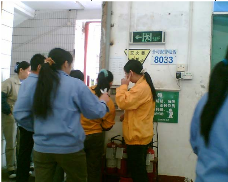
A very small number of fire extinguishers on site in the plant

In these sewing workshops, there are stacks of flammable fabrics, but there are inadequate fire extinguishers. The workers have not had any fire safety training, and if there were a fire, the results could be disastrous, PlayFair was told.