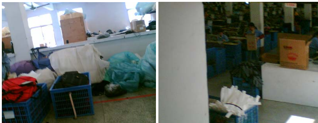
Stacks of flammable fabrics on the shop floors

According to those interviewed by PlayFair, the factory has health and safety problems that need urgent attention.