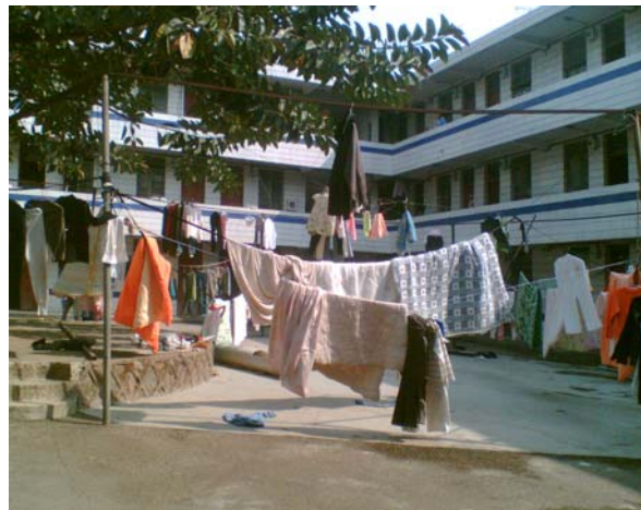
A 3-storey workers dormitory

The factory provides dormitory rooms for all its workers and deducts a fee of 12 yuan a month for rent and 15 yuan a month for water and electricity. Eight workers share one room. There are private lockers for each worker. Most of the workers live inside the factory complex, but some married couples live outside and will normally pay about 200 yuan a month in rent. The factory does not subsidize their rent payment.