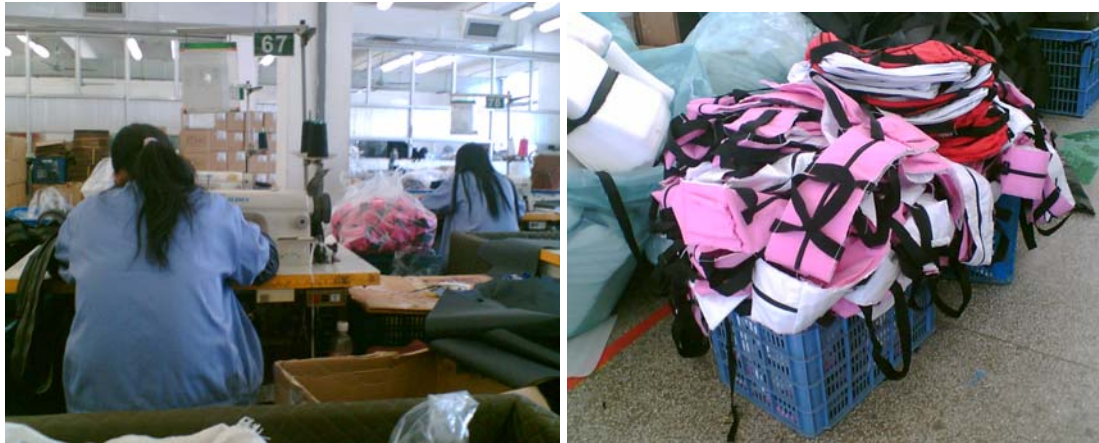
Women workers sewing bags

PlayFair had expected that a company designated as an official Olympic Games licensee and one with such a clearly stated commitment to good business ethics would uphold a higher standard, yet the wages paid to the majority of the workers are well below the legal minimum wage of 4.02 yuan per hour (700 yuan/21.75 days/8 hours).