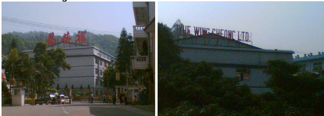
The bag manufacturing plant based in Longgang District, Shenzhen

YWC's manufacturing complex in Shenzhen is very large, consisting of five factory buildings, Blocks K, A, B, C, and D (with about 3,000 production machines), and a 3-storey dormitory, canteens, a clinic, recreation facilities (a library, basketball field and pool table) and convenient stores.