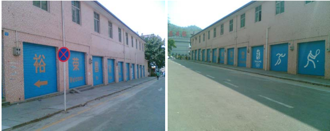
Yue Wing Cheong Light Products (Shenzhen) Co., Ltd., a designated supplier of Beijing 2008 Olympic Games (Source: PlayFair)