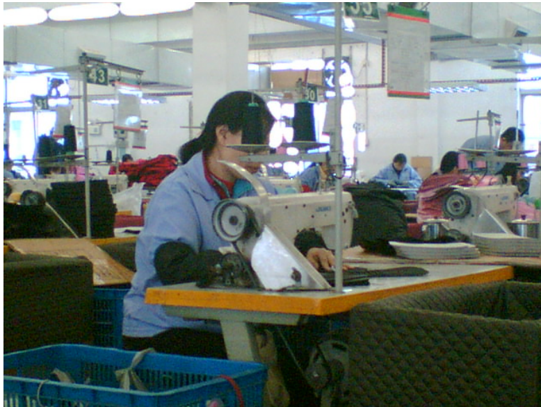
A sewing worker sits on a stool (without a back) the entire work shift

In the Handbag division of Block B, there are three workshops located in B2, B3 and B4. Each workshop has about 150 workers, operating 200 electric sewing machines. The main task is to sew the different handbag pieces.