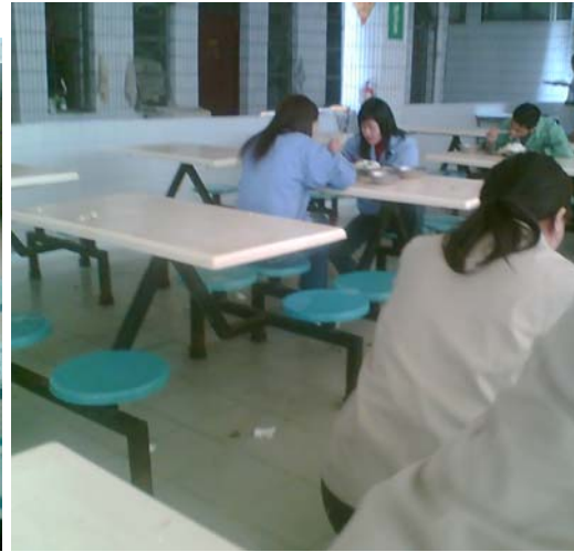
Food provided by the factory cafeteria at 120 yuan per month.

Workers find the quality of the food and accommodation at YWC satisfactory. However, they complain that the charge for food at 120 yuan a month is too high. For that fee, the factory cafeteria provides just two meals a day. Workers who choose to eat outside the factory are not charged for food, but the cost of eating outside is higher.