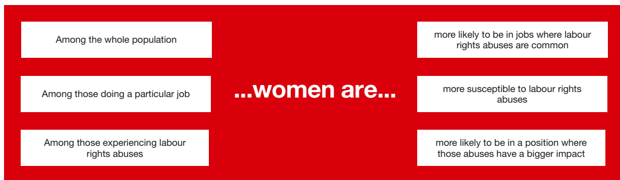
Figure 3: Why labour rights abuses affect women more

Women are pulled into the industry by employers taking advantage of the cultural stereotypes – to which women are often obliged to adhere – of women as passive and flexible. Productive, reproductive and domestic responsibilities constrain women’s ability to seek other work, to take action to improve their working conditions, or to speak out about the abuse they face, making them ideal employees in managers’ eyes. As purchasing practices ratchet up the pressure on factories, these factors make a female workforce more and more attractive to employers.