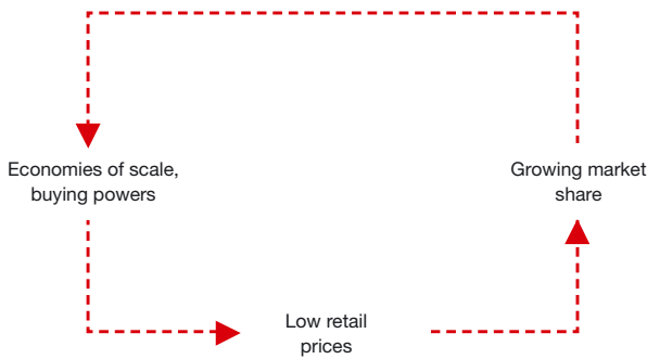
Figure 1: Survival of the cheapest

Another important characteristic is the Giants' growing reach into so many parts of the retail sector. Tesco, Carrefour and Walmart are the leading grocers in their home countries, with a third 27 , quarter 28 and fifth 29 of their home countries' grocery markets respectively, and all are on the increase. Aldi and Lidl dominate the German discount retail sector, with more than a 50% market share between them. 30